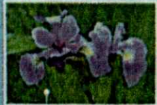
Blueflag Iris ( Iris versicolor )