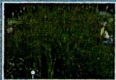
North Creek Nurseries