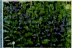
Great Blue Lobelia ( Lobelia siphilitica )