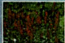
Cardinal Flower ( Lobelia cardinalis )