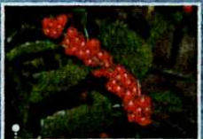
North Creek Nurseries