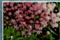
Swamp Milkweed ( Asclepias incarnata )

Check out our website for places to go buy these plants!